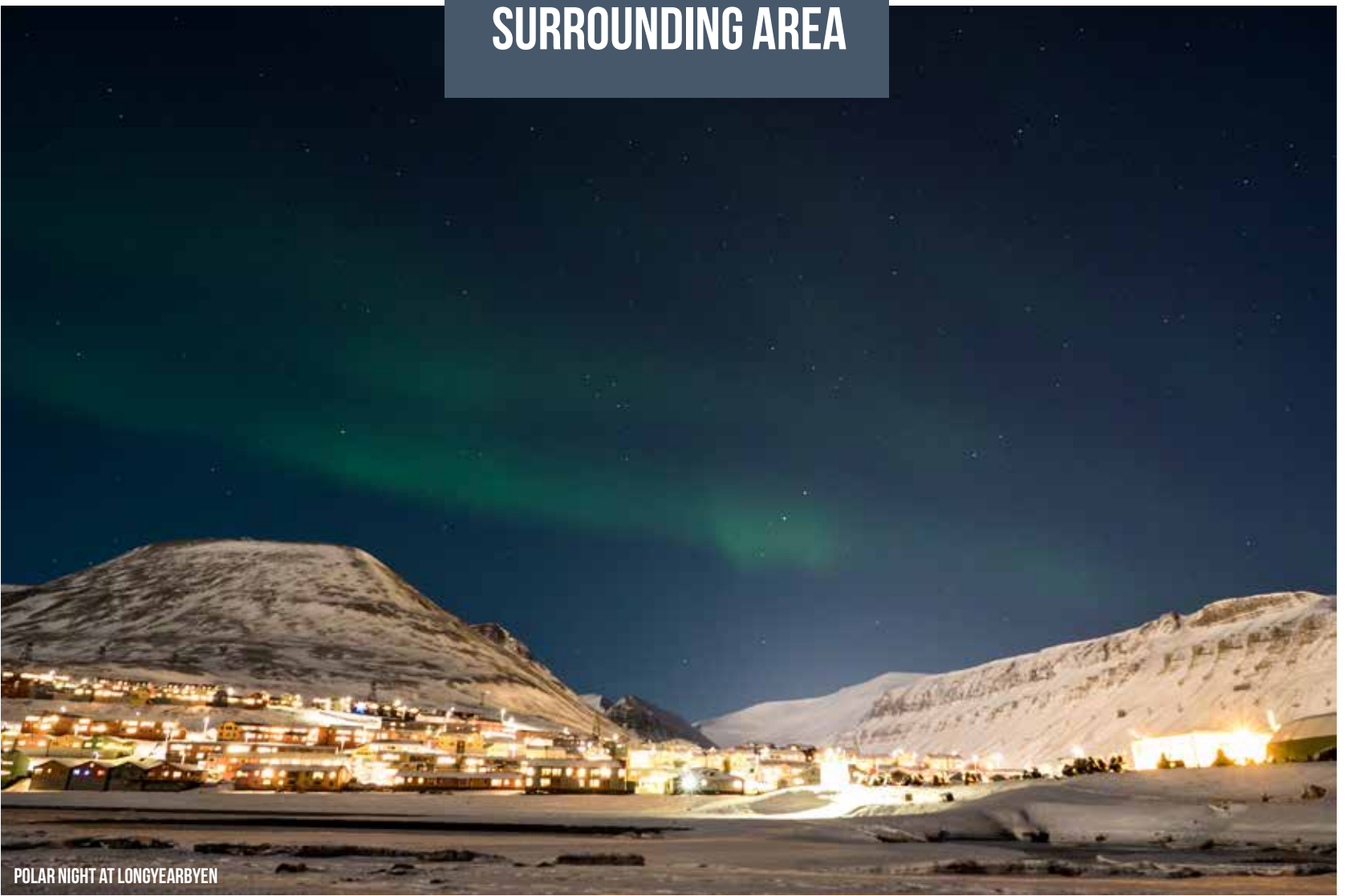
POLAR NIGHT AT LONGYEARBYEN