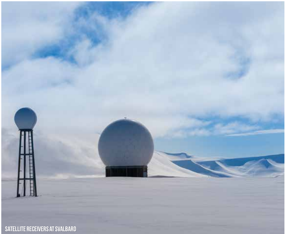
SATELLITE RECEIVERS AT SVALBARD